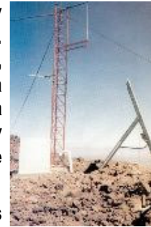
Figure 2. FonoMovil's Cell Extender® system operates at the moment with one single channel only. The site is solar powered and rises approx. 2200 meters above sea level. The Yagi antenna links the system back to the Donor site back in Neuquen. The omnidirectional antenna connects to the Cell site full duplex radio. Strong gale force winds require the mast to be left short, and heavily guyed.