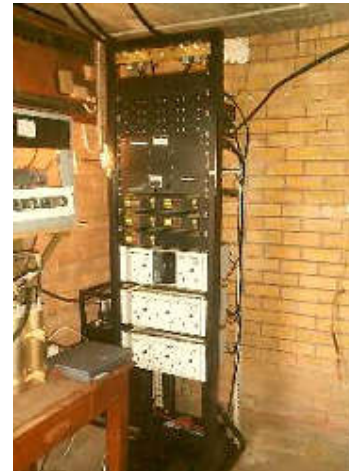
Figure 4. The Mt. View Cell Extender® site is operated by Vertel Communications, a major NSW Area Wide MPT1327 Service provider. A humble installation, but very powerful in its service to the local area....