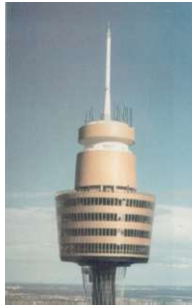
Figure 3. Sydney, the site of the Year 2000 Olympic Games, is a beautiful city, but hard to cover with radio...

Fortunately, it is not so hard if you can transmit from prime sites like Centrepoint Tower (the mast type structure in the centre of the photograph).